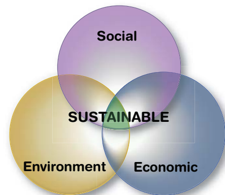
Figure 1. Illustration of the components of sustainability

The rendering industry in the U.S. annually processes more than 59 billion pounds of food materials from the meat, restaurant and bakery industries that, despite being wholesome, are not typically consumed by humans in the USA. To recycle these food materials, which may contain 60% or more water, the rendering industry must first evaporate or remove the moisture. The dried materials are then further processed to produce useful products that have value as concentrated sources of energy and rich sources of nutrients, such as protein, amino acids, minerals and fatty-acids. Though not well publicized, the recycling services provided by rendering companies such as Darling International Inc. and Griffin Industries LLC (“Darling/Griffin”), including the services provided under our shared DAR PRO Solutions brand, are essential to protecting the environment and in addressing many social and economic issues. To say it simply, rendering is the essence of sustainability. (Figure 2).